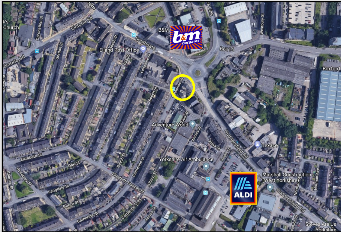
Situation plan in relation Aldi and B&M